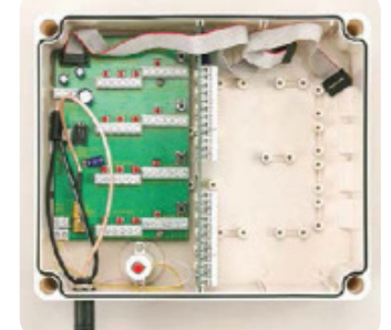
CONNECTING ON EXPANSION MODULE USING THE RIBBON CONNECTOR