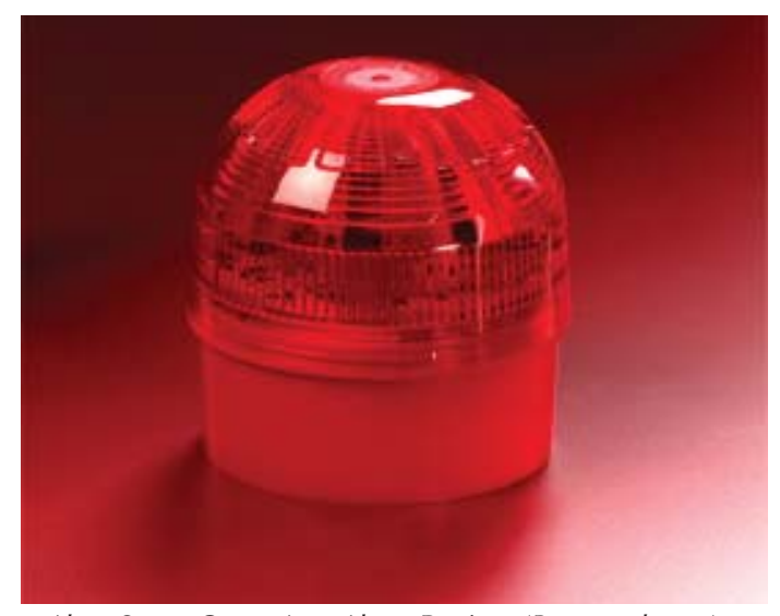
AlarmSense Open-Area Alarm Devices (Beacon shown)

AlarmSense sounders and manual call points are fitted to the same zone as detectors. In quiescent state, the zone is powered at between 9V and 15V, nominally 12V, at which only detectors and call points operate. Sounders require 24V to operate.